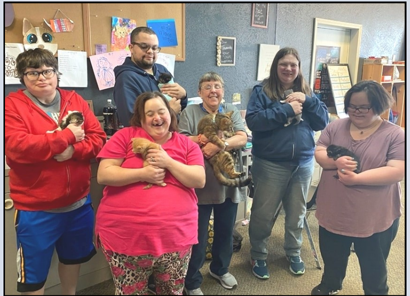
The Mercer County Civic Foundation proudly supports the work of Mercer Residential Services, Inc. Here several MRSI clients cuddle with foster kittens.