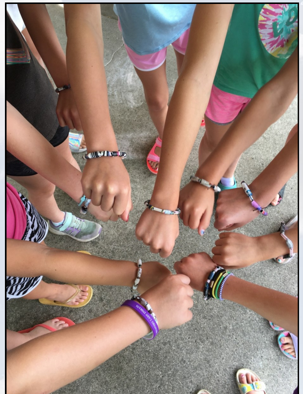
Making bead bracelets was just one of the many activities featured through the Arts in the Park summer program for youth.